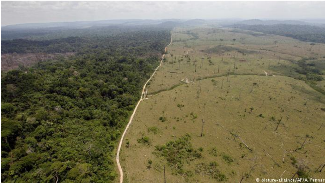
Figure 2: Aerial photo shows illegal deforestation in the Jamanxim National Forest

nesting sites may be a crucial factor limiting colonies reproduction (Inoue et al., 1993 in Pioker-Hara et al. ,2014, p1).